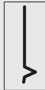
Profile view of Driwall™ Weep Screed

This product is required by all major building codes & the International Building Code at the bottom of all framed walls.