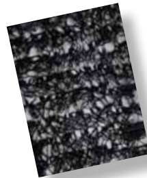
Drivall™ PCD is 0.125 - 0.75 inches thick (3.175 - 19.0 mm thick)

A filter fabric is heat-laminated to one side of the mat to hold soil or concrete away from the wall or deck and keep the drainage plane clear.